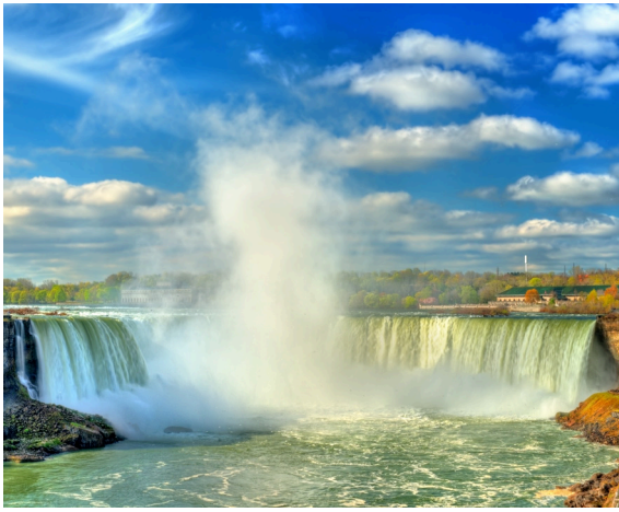
NIAGARA FALLS, ONTARIO, CANADA