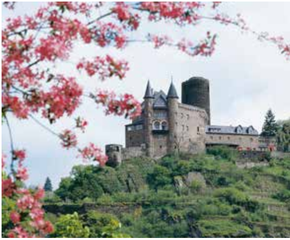
KATZ CASTLE, GERMANY